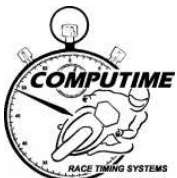
Clerk of Course - Brendan Ferrari

Computime Race Timing Systems Pty Ltd © 1996 Licensed to Computime Race Timing Systems